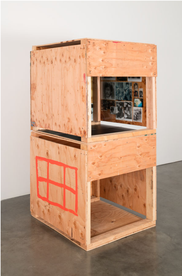
Will Boone, Born to Sleep in the Sun II , 2015. Acrylic, magazine clippings, photos, bar top resin on wood, 69 × 36 3/4 × 33 1/2 inches. © Will Boone.

Language Problem ), 2015. Plywood letter cutouts, hot glue and corrugated plastic, 47 × 47 × 45 inches. © Pope.L.