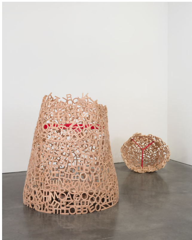
Pope.L, Cone in a Forest and Cone for My Sister (Private

Boone deals with origins in several makeshift shrines, cobbled together out of odd pieces of plywood, Plexiglas, and wire. The structures are titled Born to Sleep in the Sun I, II, and III ; one is crowned by a small